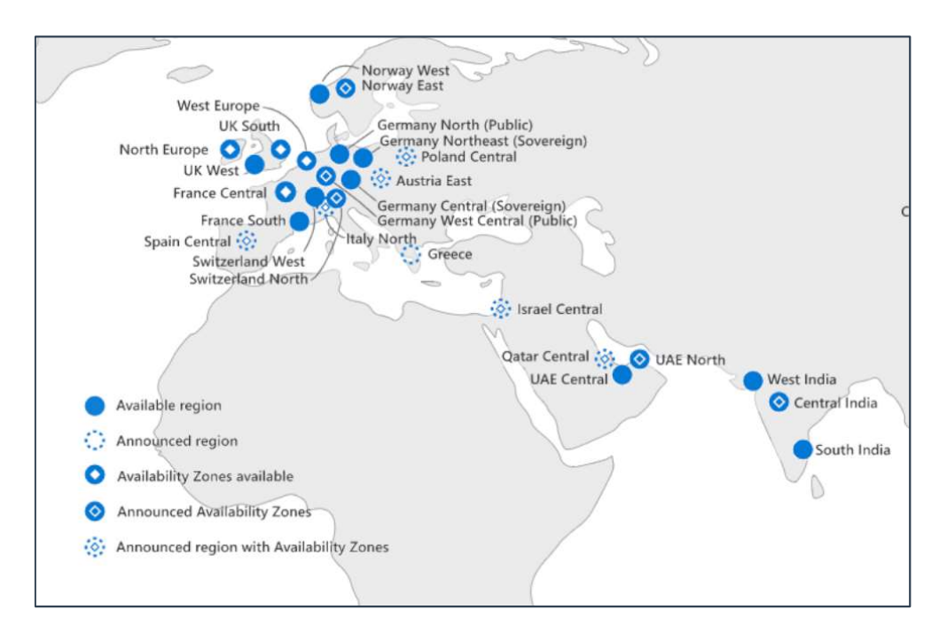
Microsoft Azure Data Centres

In accordance with the EU GDPR regulations, that the UK are still aligned with, all of the data stored by Simple GMS is held within the EU at Microsoft's West and North Europe data centres. If the UK Government change the legislation then the way in which it is stored and managed will be changed accordingly.